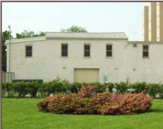
The existing garage will house the new emergency generator and new larger cooling tower that is required to provide air conditioning in the Temple Room, Atrium, and Banquet Hall. Louvers will replace windows to allow sufficient air into the building. Location of these large pieces of equipment to the garage will reduce the modification necessary to the House of the Temple building.