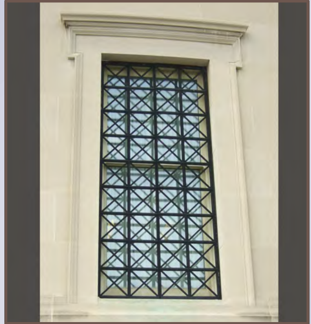
This before photo shows the black painted metal grille and the buff colored paint on the window frame and sash.

D URING APRIL 2013, the design of the new accessible and service entrances was refined to minimize impact on the building. Discussions with the local community have begun ahead of the submission to the Historic Preservation Review Board at the end of May. The preliminary work completed on the exterior windows and stone is very helpful in explaining to the review agencies the proposed restoration effort.