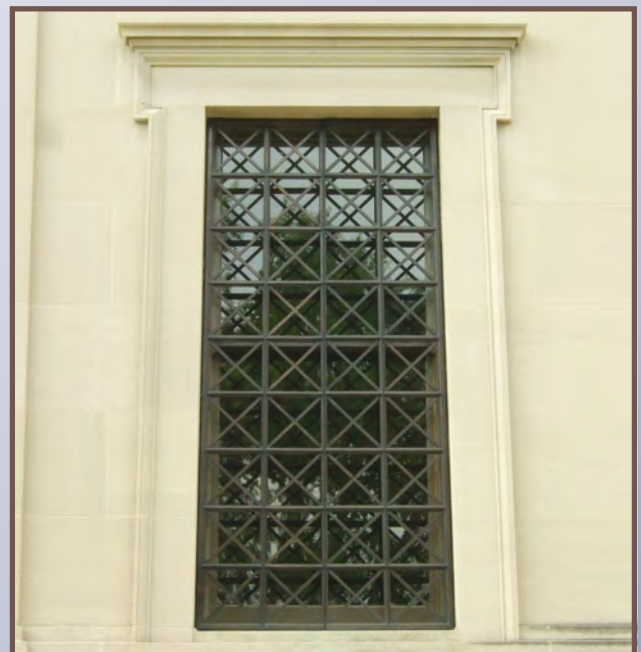
Completed rehabilitated window including restoration of original finish on the metal grille and original paint color on sash and frame restores the sense of elegance to the building.