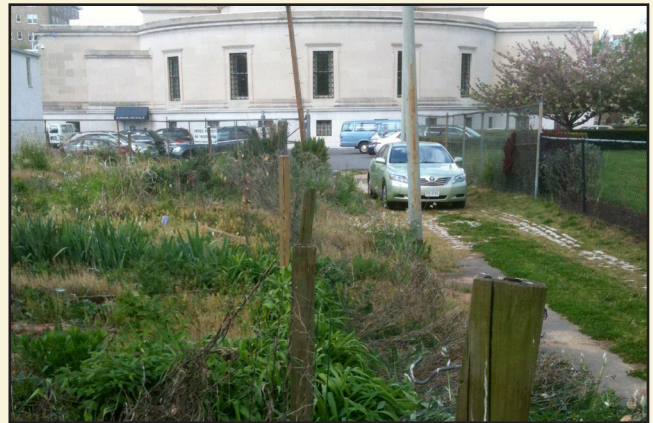
The former garden area on the left side of the photo will be temporarily converted into a staging area for construction materials and equipment. House of the Temple staff have salvaged and replanted any significant plant material from the garden to other locations on the property.