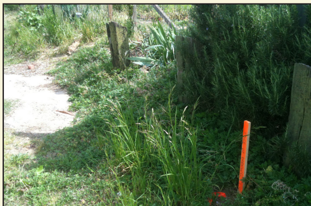
Prior to the start of excavation, each corner of the area to be excavated was identified as were the mid-points along each side. The orange marker in the foreground is typical of the stakes used to locate the features. Additionally, a benchmark for vertical control is established to set the elevation of the site.