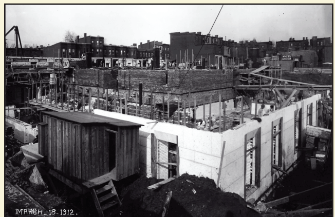
Following the ground breaking in October 1911, the masonry inner structure is rising above the granite/brick outer wall of the Basement level by March 1912. These construction photos are extremely helpful to the Renovation Team in understanding the sequence of the original construction as well as information about materials and methods used for construction..