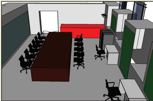
The Big Room will have a central meeting table with updated schedule, plan table and individual work stations for team members. During the design phase, the team will meet to review the development of various systems in particular areas of the building.

D URING FEBRUARY 2012, a room on the first floor of the House of the Temple was provided to the Renovation Team from where the project will be centrally managed. This room, dubbed the “Big Room,” will be used as the project hub during the design and construction process by the architects, contractors, engineers, etc. Designers and contractors will use the Big Room to facilitate and streamline decisions and schedule. Critical to the success of the renovation is understanding the original construction sequence. The Renovation Team continues to review the original construction photos to understand the process and answer questions as the course for the renovation is charted.