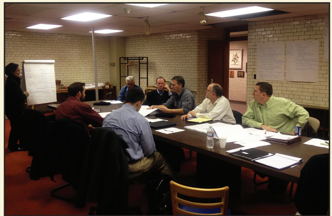
Team in Big Room developing alternatives to sequence of the renovation work with particular attention to work which could occur without disturbing the day to day operations of the Scottish Rite.