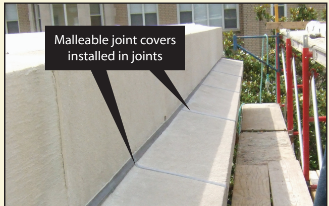
After the cornice cleaning, malleable joint covers were installed to minimize the water infiltration into the joints between the stones.