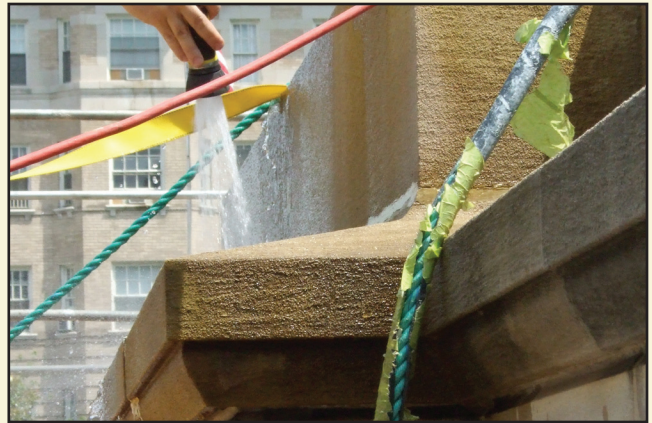
The cornice stone being rinsed as part of the cleaning process. Scaffolding allows good access to the front of the building.