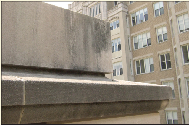
The testing completed in the Fall of 2010 established the cleaning methodology for the west elevation this spring. This images shows the southeast cornice of the building before cleaning, which is typical of the condition of the stone prior to cleaning.

D URING MAY 2011, the Renovation Team strategized on the planning for the remainder of 2011 to include schematic design and further exploration of a few remaining questions including the original paint schemes for the ceremonial areas and fire protection concepts. As part of the ongoing building maintenance, the front entrance walls are receiving a thorough cleaning. Malleable joint covers are being installed in the coping and cornice stones to protect the building from water infiltration.