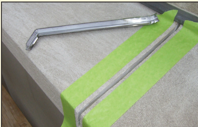
Stone joint being prepared for the installation of the joint cover. The malleable joint cover is trimmed and adjusted to suit each condition. Sealant will be installed in the joint and then the joint cover will be set in the joint.