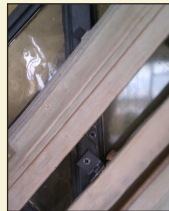
The ray was reattached to the support using a tap and screw to mechanically fasten the ray to its support. While the circumstances were unexpected, the opportunity to access and review the condition of the ray attachments is helpful in planning for the future refurbishment.