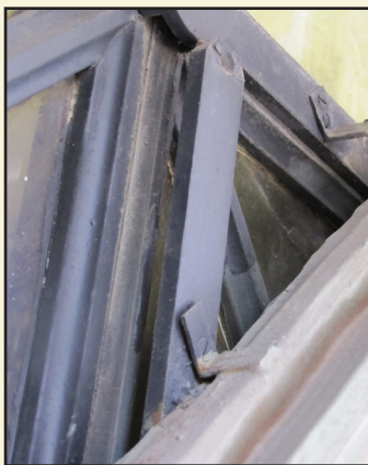
The August earthquake dislodged rays of the glory on the west side of the Temple Room. While this situation was attributed to the earthquake, the other rays of the glory have become loose and attachments have failed due to corrosion and failure at the mechanical connections.