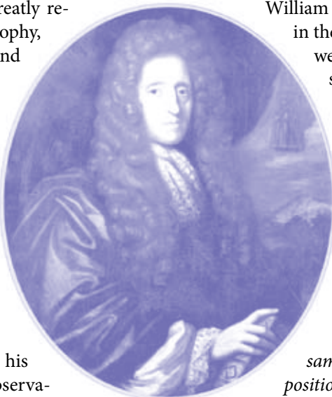
John Locke, oil on canvas by Herman Verelst, 1689; in the National Portrait Gallery, London.

Do I propose, then, that every citizen shall be free to follow his own reason, and believe whatever this enlightened or deluded